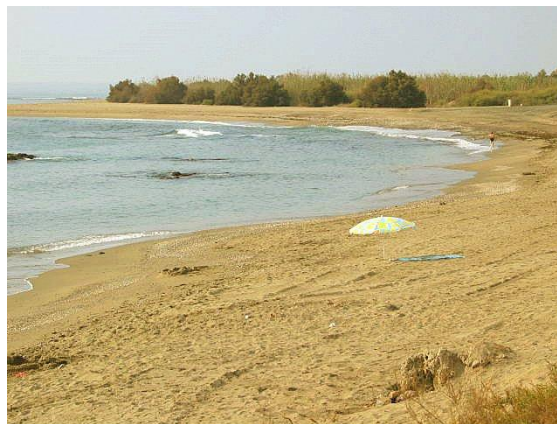
Sandy beach at the southern end of Villaricos

The Apartment sleeps up to four adults. Bedding and towels are included in the letting price, with the exception of beach towels. The apartment is cleaned prior to and immediately after each letting. There is a washing machine available for guest use. Beaches are walking distance away.