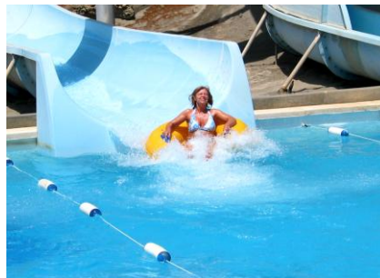
Waterpark at Vera

Parque Aquatico Waterpark is located on the road to Vera, only 5 minutes drive away: