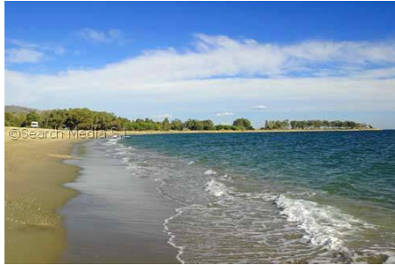
Quitapellejos Beach (5 mins drive away)