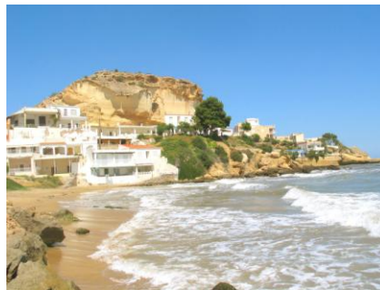
Beach and cave houses at San Juan de los Terreros (15 mins drive North)

Parque Aquatico Waterpark is located on the road to Vera, only 5 minutes drive away: