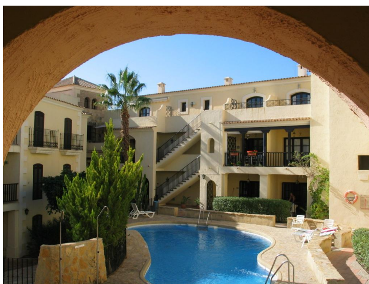
View of apartment and pool

The Apartment is close to all of the local amenities, including two small mini-markets. The sea front promenade is 100 metres away. There are a number of local bars and restaurants, including two that overlook the two pretty marinas located at each end of the promenade. For livelier nightlife and a wider range of shops, Garrucha (9km), Mojacar Playa (14km) and Vera (5km) are a short drive away. The nearest hypermarket is 5 minutes drive away (“Consum” near Vera Waterpark).