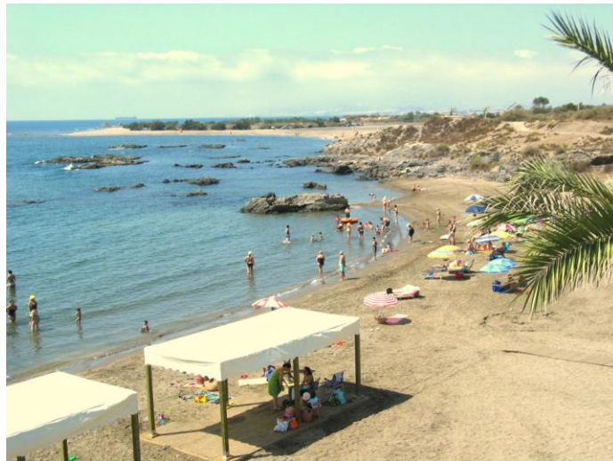
Sandy beaches are just a few minutes walk away

There are two sandy beaches a few minutes walk from the apartment, close to the southern marina and an ancient defensive tower. Both of these beaches have a “Chiringuito” or beach bar open through the summer months serving food and drink. There is a small shingle beach located between the two marinas which is ideal for fishing.