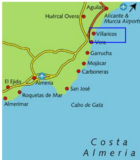
Map of Costa Almeria showing nearest airports and motorways