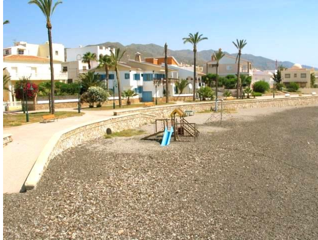
View of Villaricos promenade

The small fishing village of Villaricos lies On the north eastern coast of Andalucia, between Garrucha and Aguilas. The Sierra Almangrera Mountains rise up behind the village and provide a dramatic backdrop.